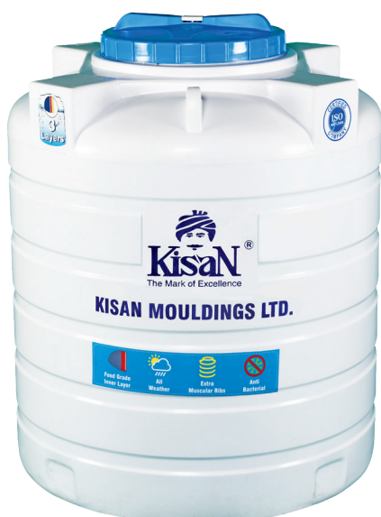
Fig 3: Water Tanks

3. Water Tanks: We have launched superior quality, food grade and UV Resistant multi layer water tanks. This line of product is asset-light and expansion to multiple areas is done using local manufacturers (Project – Sambandh). Your company leverages its brand power and deep know-how of resins to deliver superior value to customers.