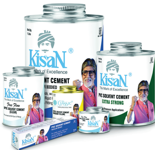
Fig 2: Solvent Cement

3. Water Tanks: We have launched superior quality, food grade and UV Resistant multi layer water tanks. This line of product is asset-light and expansion to multiple areas is done using local manufacturers (Project – Sambandh). Your company leverages its brand power and deep know-how of resins to deliver superior value to customers.