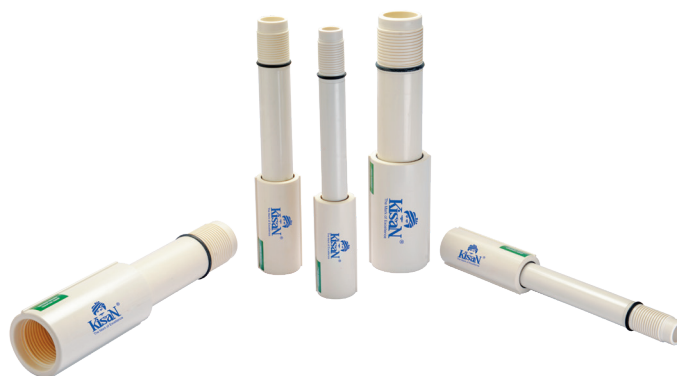
Fig 1: Column Pipes